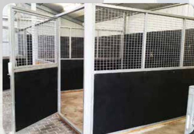
Essential Equine Veterinary - VIC