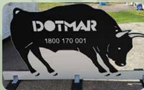
Working Equitation Bull

No painting required | Graffiti resistant UV Stabilised for the harsh Australian sun Highly impact resistant | Durable Tough | Easily cleaned