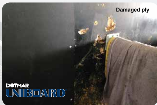
Dotmar Uniboard panel replacement of plywood at Warwick Farm Racecourse - NSW