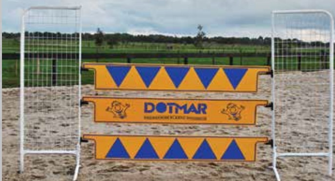
Each board is 3000mm x 290mm x 12.7mm thick. Other dimensions available on request.

Dotmar DazzleBoards fit on to standard cups and look spectacular. You can choose your own design such as Club or Stud logo, or select from our range of ideas. Dotmar DazzleBoards can be purchased in sets of 3 or as individual boards.